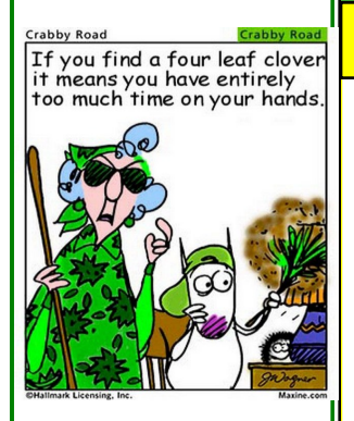
17th- St Patricks Day!!